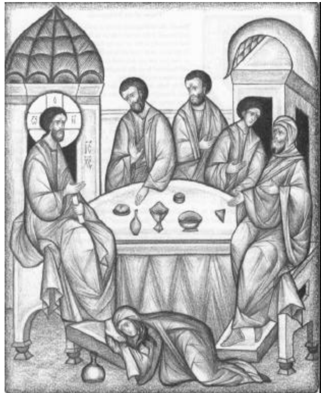
Jesus at the house of Simon the Pharisee

Philanthropists feel a moral and fiduciary responsibility to accomplish as much good as possible with their limited ability to give. This is consistent with the Orthodox view of good stewardship. Furthermore, philanthropists, like any other person, do not wish to be treated as the local ATM – walk up; put in the card; take out the money; turn and walk away. This may be the all-too-common method by which philanthropists are treated by representatives of